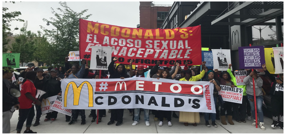
McDonald's workers are fighting back against sexual harassment on the job.

Headquarters in Chicago, Illinois Franchises and corporate-owned stores around the globe