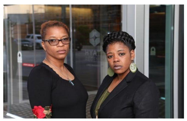
XPO warehouse closure "reeks of retaliation" against workers seeking answers about death and miscarriages on the job.

On February 25, the company announced that jobs would be available for workers at the closed facility at other XPO warehouses. As of mid-April, however, many workers at the closed warehouse still do not have information about possible new assignments.